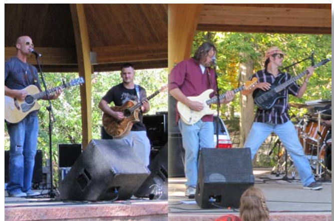
Ben Sutton Band (left) and Down-N-Dirty rocked.