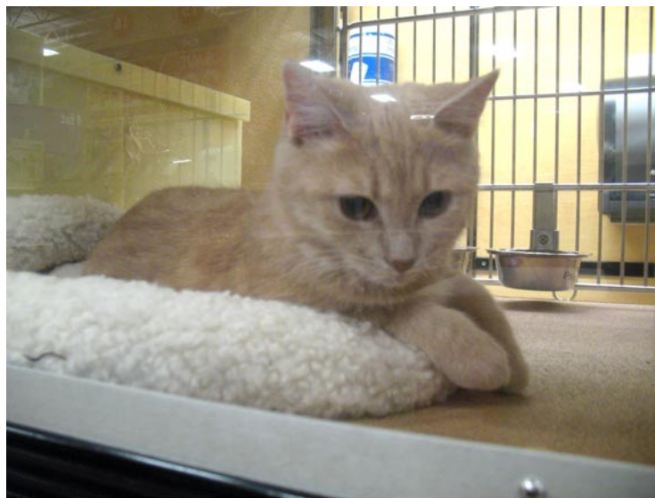
A beautiful tabby, Amelia, waits for love at PetSmart.

So if you want to "think local" and have your actions make a difference in our local community, please consider supporting the Humane Society of Alamance County with your tax-deductible contribution in any amount. See the last page of this newsletter for a donation form, and give your local love to local animals. And thank you, from the bottom of our hearts!