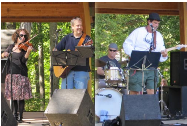
Graymatter (left) and The Sticky Wickets performed.