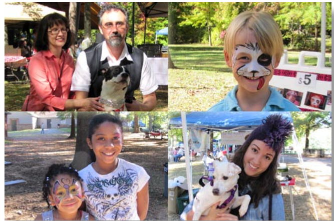
Human and dog faces in the crowd.

Thank you so much from the bottom of our hearts for supporting our Spay/Neuter, Foster/Rescue and Humane Education programs.