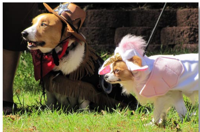
Dog were styling in the Dog Costume Contest.