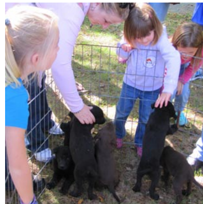
Children show the love to puppies at Woofstock.

T HE IDEA to “think local” in food and farming has been gaining traction in recent years. Can we also “think local” for the animals? Yes, absolutely!