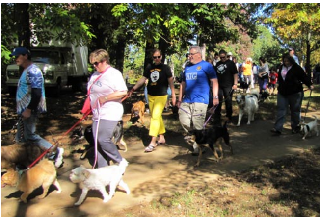
Dogs lead the way in Tour de Tailwaggers XIII.